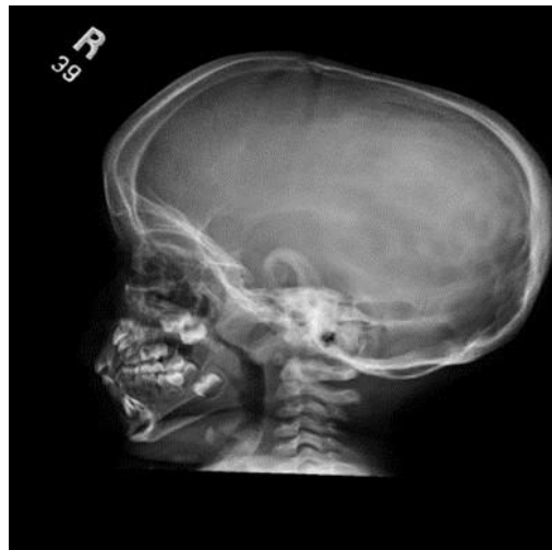
Figure 4: Radiograph showing the sagittal suture with elongation of the cranium in patient #7