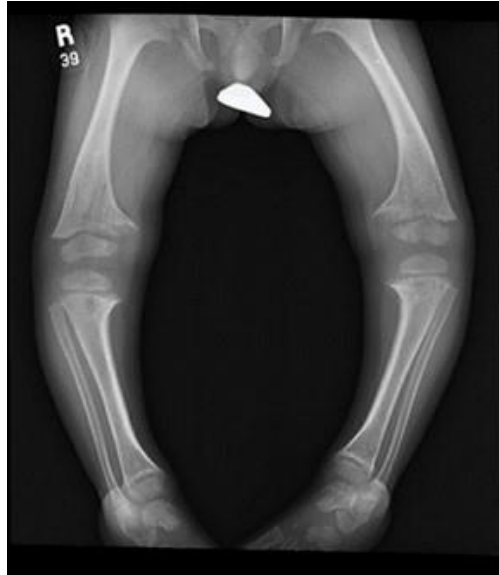
Figure 3: Radiograph of the lower limbs showing bilateral genu varum in patient #7