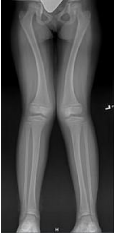
Figure 2: Radiograph of the lower limbs showing bilateral genu valgum in patient #1