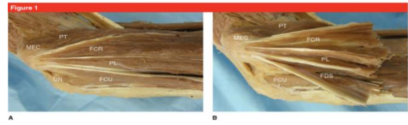
Figure 1: The ulnar nerve (UN), the medial epicondyle (MEC), and the anatomy of the flexor-pronator muscles, including the pronator teres (PT), flexor carpi radialis (FCR), palmaris longus (PL), flexor digitorum superficialis (FDS), and flexor carpi ulnaris (FCU), are shown in the images in A and B of a cadaver elbow [8].

The five forearm muscles that make up the flexor-pronator tendon are the flexor carpi radialis (FR), pronator teres (PT), and long-fingered palms and ulnar flexors (FCU), and the superficial flexor of the digits (Figure 1). In most elbows, the common flexor tendon (CFT), which measures about 3 cm in length, medially stretches across the ulnohumeral joint. It connects to the medial humeral tendon anterior epicondyle and the front bundle proximally of the ulnar collateral ligament (UCL), having its fibres parallel to the UCL. Particularly the ulnar head of the PT, confluent with the CFT in an area of the anteromedial joint capsule that is hyperplastic [7].